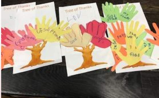
Parents Night Out Craft:

The children made a “Tree of Thanks” where they listed their blessings on their hand prints which served as leaves for their blessing tree. Such blessings included friends, family, church, God, home, parents, food, pets, Jesus and others!