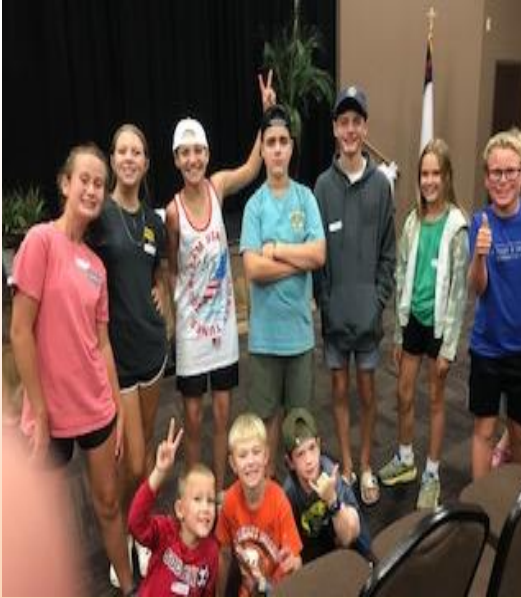
A candid shot of several awaiting their next rotation.