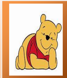
Winnie the Pooh

"It's the first day of autumn! A time of hot chocolatey mornings, and toasty marshmallow evenings, and, best of all, leaping into leaves!"