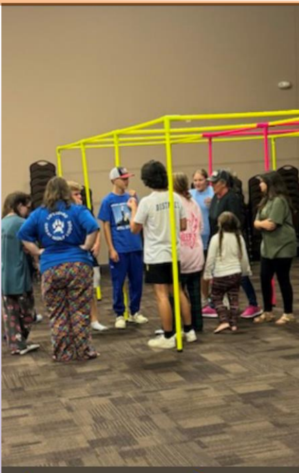
Strategizing the Nine Squares game!