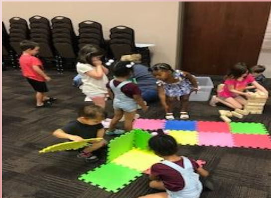
Our younger children during free time.

For those volunteers who are able to come early, there will be a brief meeting on Friday (9/6) at 5:30pm, prior to PNO.