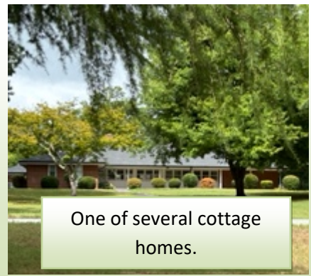
One of several cottage homes.