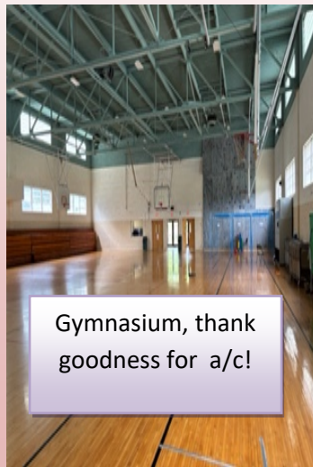
Gymnasium, thank goodness for a/c!

Note: For privacy reasons, no pictures were taken of the children or staff.