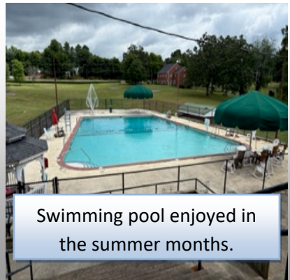
Swimming pool enjoyed in the summer months.