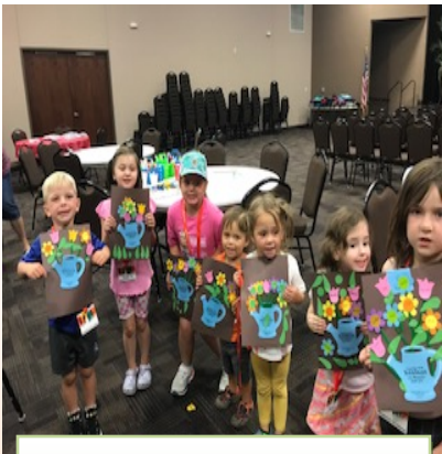
PNO Crafts: Preschool & Older Children