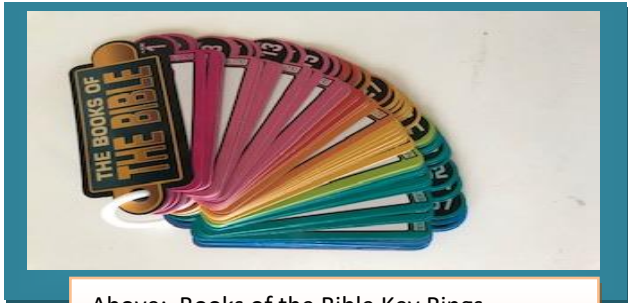
Above: Books of the Bible Key Rings Below: Children's Story Bible used at PNO

Ways to Help: Several folks, who are unable to volunteer, have asked how they can help with Parents Night Out. Our kids love to play basketball during recreation time. Our basketball goals were damaged, and we are in need of a new one. Also, last month, we had bible key rings to help the kids with learning the books of the bible. Several of the kids asked for their own key ring. In addition, we could always use items for crafts and the treasure box. If you would like to donate to any of these items, just mark your check or envelope "Parents Night Out". Thank you for supporting our program!