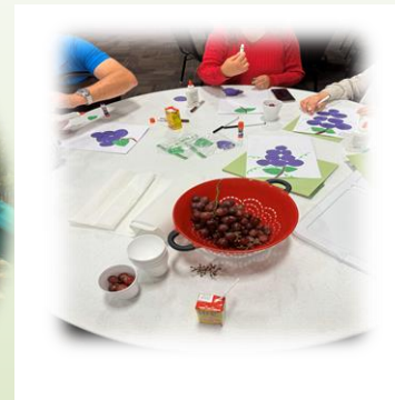
Above: Various Children's Church Pictures