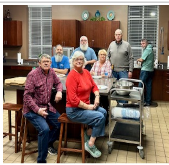
Right: Our Meal Team and Security