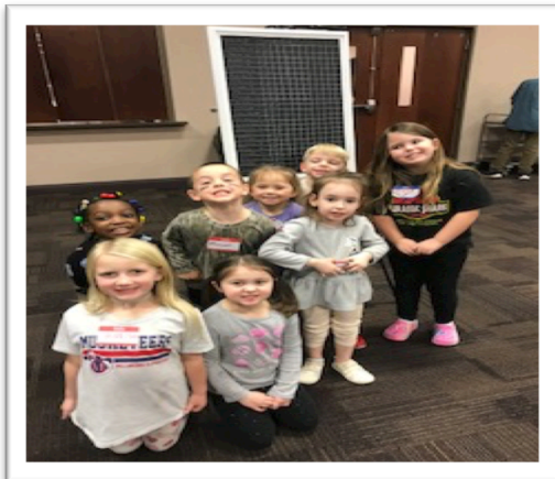
Left: Our preschoolers standing in front of an attendance and memory verse chart. Those who regularly attend and memorize their verses get a special prize.

Daughters of the King: Daughters of the King will continue our study, “Discovering Your Spiritual Gifts,” Tuesday, March 12 th . Please plan to attend!