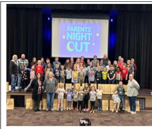
Left: The entire crew

Last month we had another great night with our children and youth!! On March 1 st , we have a lot of Easter activities planned and our lesson will be on the resurrection of Jesus. All children and youth are invited (ages 3-18). Help us spread the word by inviting others!