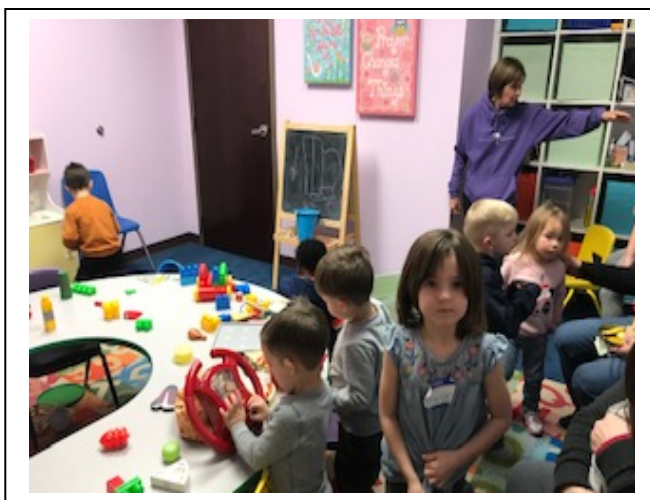
Hard at work at Parents Night Out!

Last month we had a record setting attendance with 45 children and youth!! We're hoping for another great night on Feb 2 nd ! We have a number of Valentine activities planned and our lesson is found in Acts 2, the Day of Pentecost. We'll be learning about worship, service and forgiveness no matter the language or race. Please continue to pray for our program as we share the gospel of Jesus Christ with all ages. All children and youth are invited (ages 3-18). Help us spread the word by inviting others!